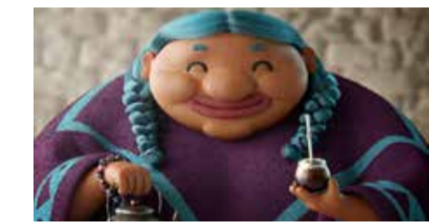
Mate, Budo TV, Argentina

Filmi z dialogi so opremljeni s slovenskimi in angleškimi podnapisi. All films with dialogue are subtitled in Slovenian and English.